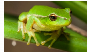
Green tree frog

Did you or the tree frog jump longer ? By how much shorter or longer did you jump than a tree frog?